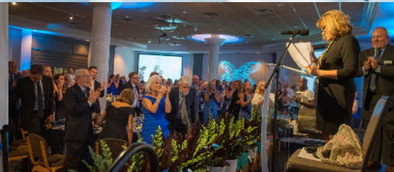
Applause and support for the mission moment speaker