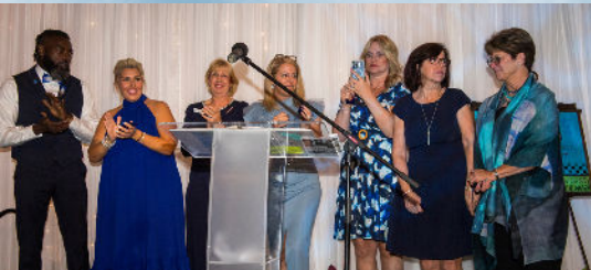
Honoring child abuse survivors and WARRIORS