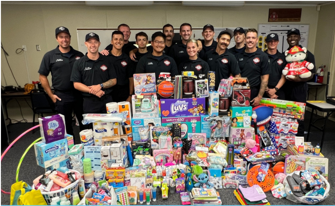
Such incredible generosity from STC's Fire Academy, who chose CPC for their project. Fire safety, body safety, public safety- when we come together for kids, the safety nets around them are strengthened!

We're so thankful to have such an incredible community of support surrounding us and our mission- the prevention, intervention, and treatment of child abuse. Thank you!!