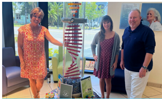
A generous donation of supplies for our clients thanks to Sydney and Everglades University.