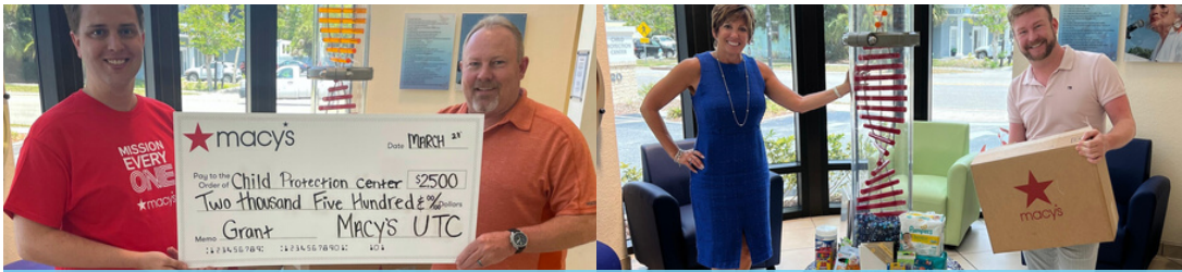
Not only did our friends at Macy's award a grant for CPC's prevention services and education, they also held a donation drive to collect all kinds of goodies for our clients in therapy and visitations!