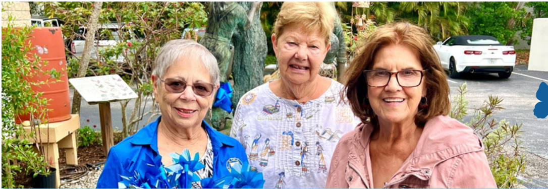
Each year during Child Abuse Prevention Month in April, the ladies of GFWC plant a pinwheel garden at CPC's Sarasota office to sprinkle joy and awareness around the entire property.